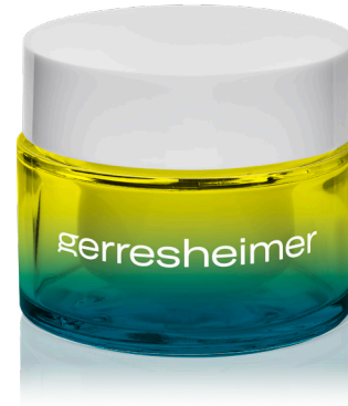
Gx CyClic® refillable glass jar with Medicos Beauty Re-CLICK insert and closure

Whether it's off-the-shelf options or a customized design, we're your dedicated partner in transforming your requirements into reality.