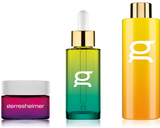
Gx® Ultralight PCR glass jar 50 ml – 59 g