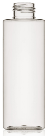
Plastic: up to 100% rPET