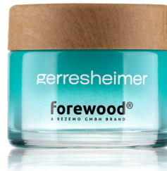
100% plant-based closure solutions

With the bio-based closure by forewood® and our Gx® Amsterdam glass jar we have created the perfect match for sustainable beauty. The closure is made of 100% plant-based material and gives your brand an unique style with multiple individualisation options.