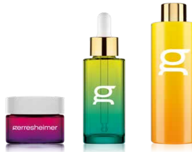
Gx® Ultralight PCR glass jar 50 ml - 59 g