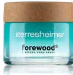
100% plant-based closure solutions

With the bio-based closure by forewood® and our Gx® Amsterdam glass jar we have created the perfect match for sustainable beauty. The closure is made of 100% plant-based material and gives your brand an unique style with multiple individualisation options.