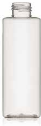
Plastic: up to 100% rPET