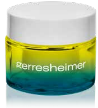
Gx CyClic® refillable glass jar with Medicos Beauty Re-CLICK insert and closure

Whether it's off-the-shelf options or a customized design, we're your dedicated partner in transforming your requirements into reality.